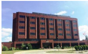
ESH — Regan Unit, Cranston

Our focus is on recognizing each patient's individuality and their right to dignified and high-quality care.