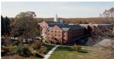
ESH — Zambarano Unit, Burrillville